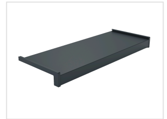
Profile with ALU-DROP® Cover Removable polymer cover over the profile