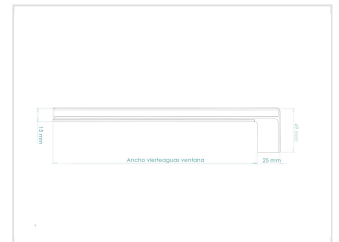
Right side cap Aluminum end cap for the right end