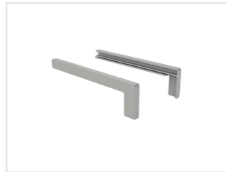
Perfil ALU-DROP® Profile with integrated drip edge, no cover