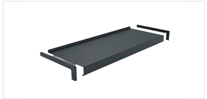
ALU-DROP® System (exploded view) Aluminum profile + polymer ALU-DROP® cover + side caps